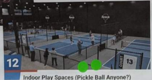
12 Indoor Play Spaces (Pickle Ball Anyone?)