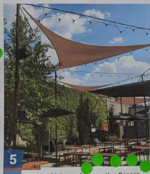
5 Outdoor Dining and Connecting Spaces