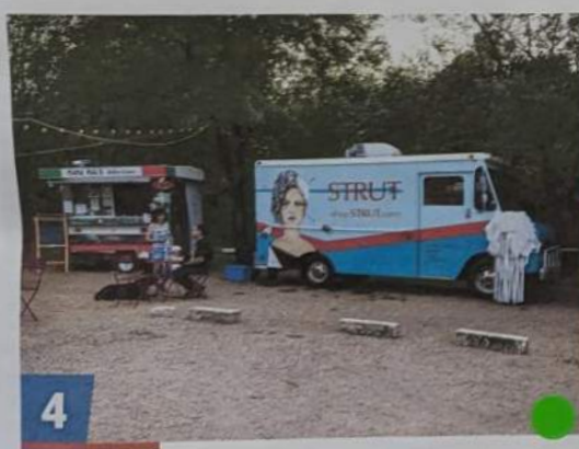
4 Food Trucks/Outdoor Gathering Spaces