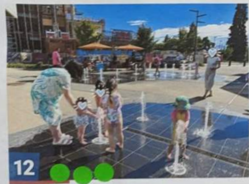
12 Public Gathering Spaces/Play Areas