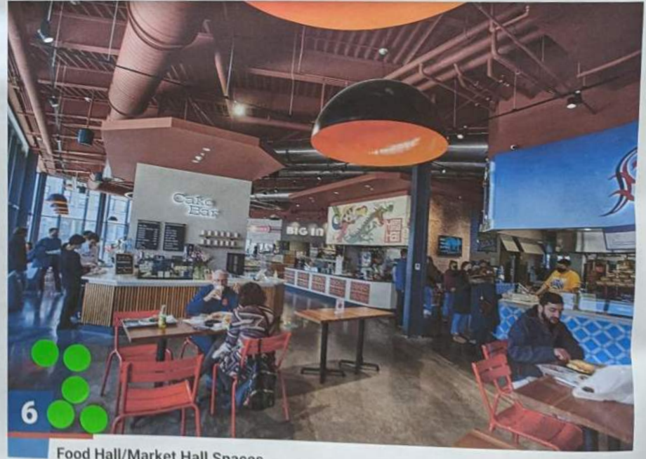
6 Food Hall/Market Hall Spaces