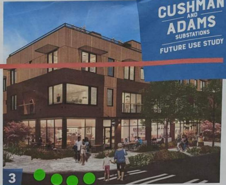
3 Mixed Use with Residential over Active Uses