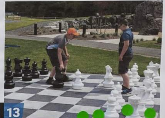
13 Outdoor Games