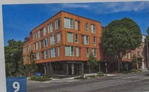
9 Four Story Apartment Building with Ground Floor Public Space