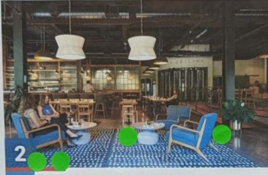
2 Lounge Space as Part of Winery/Tasting Room