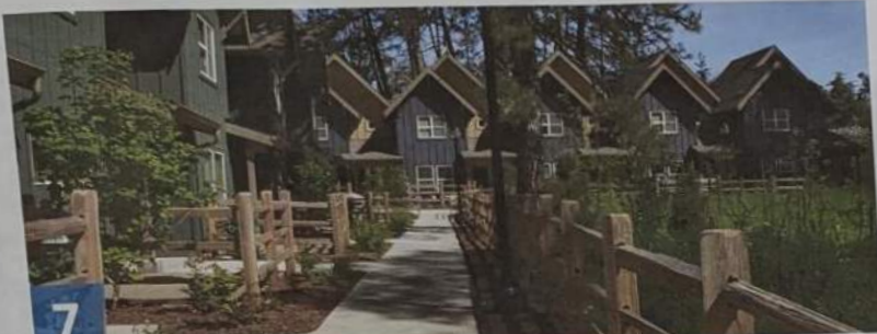
7 Residential Scale Affordable Housing with Green Space