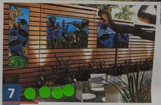
7 Outdoor Art Gallery Spaces