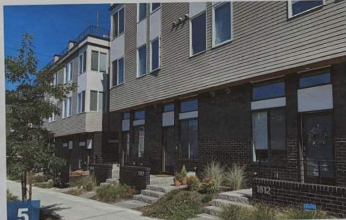
5 Live/Work with Offices and Studios at Ground Level; Apartments Above