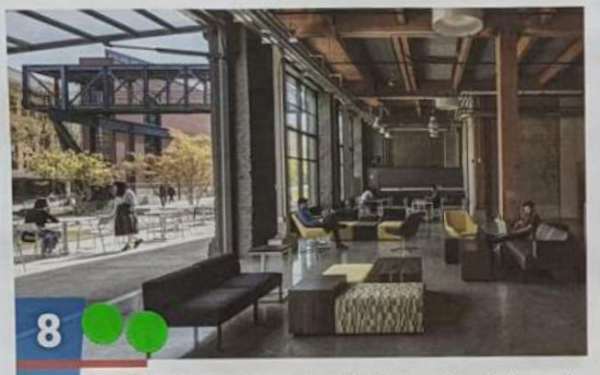
8 Office Space with Indoor/Outdoor Flow Through