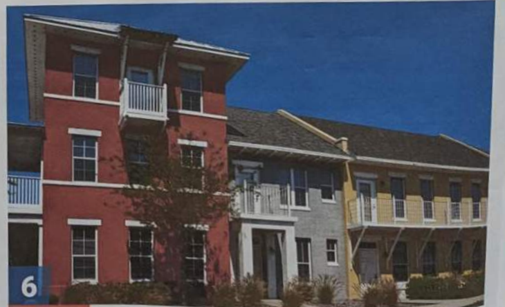
6 Housing at Varying Scales; Stacked Flats and Multiplexes