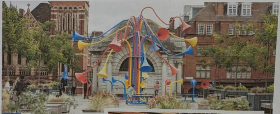
6 Sculpture Gardens/Outdoor Gardens