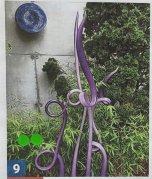
9 Seasonal Temporary Art Installations