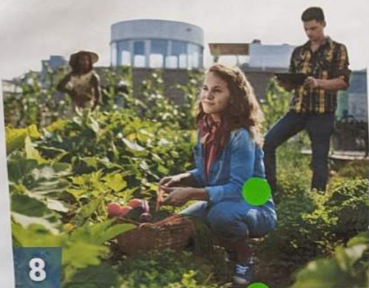
8 Community Gardens

CUSHMAN AND ADAMS SUBSTATIONS FUTURE USE STUDY