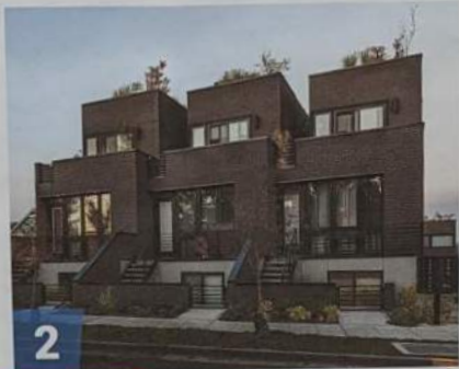
2 Brownstone Townhouses