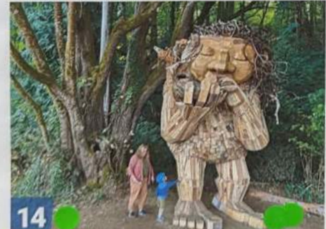
14 Large Scale Art Piece