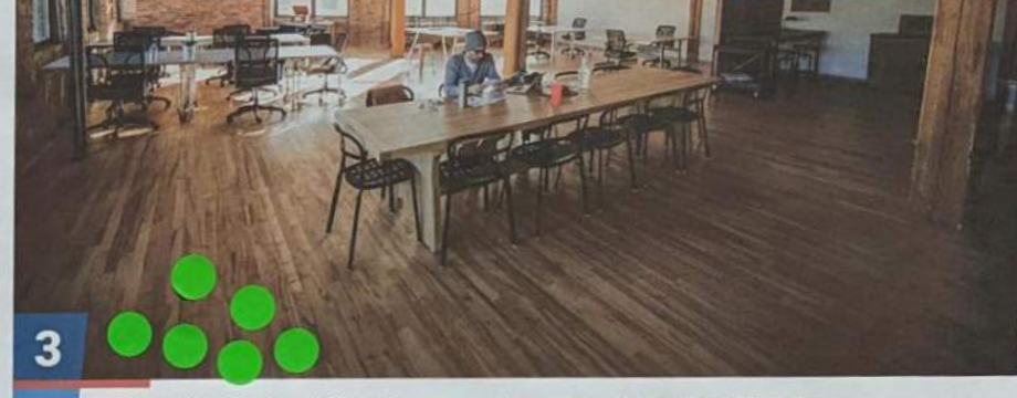
3 Community Center, Office Space, and/or Shared Flexible Use Space