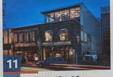
11 Small, Local Retail Space