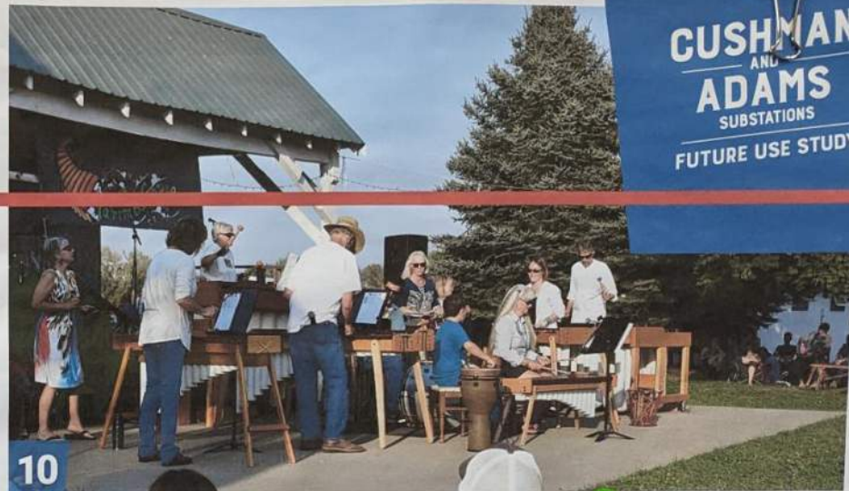
10 Outdoor Lessons/Learning/Performance Spaces