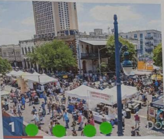
1 Festival Streets or Shared Streets

CUSHMAN AND ADAMS SUBSTATIONS FUTURE USE STUDY