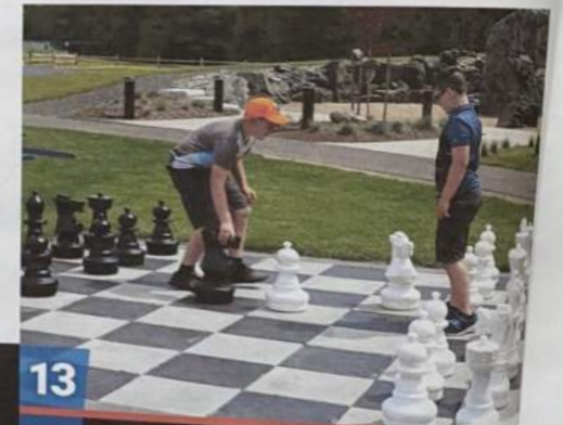
13 Outdoor Games