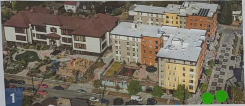
1 Mixed Income Residential over Active Use with Outdoor Public Spaces on Historic Site with Adaptive Reuse, Beacon Hill, Seattle