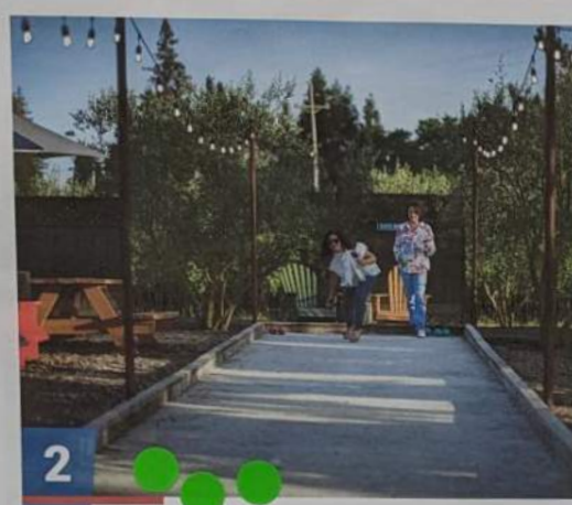
2 Bocce Courts/Outdoor Play