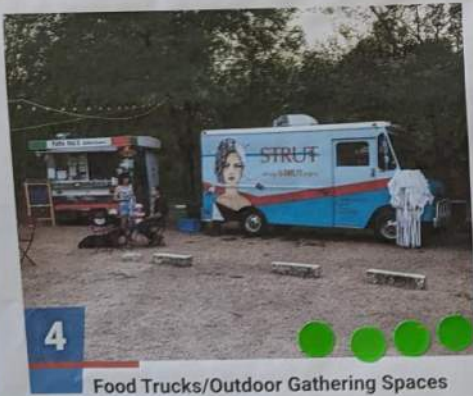
4 Food Trucks/Outdoor Gathering Spaces