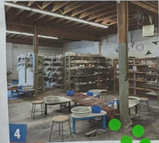
4 Crafting and Arts Studios