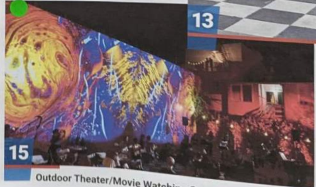
15 Outdoor Theater/Movie Watching Space