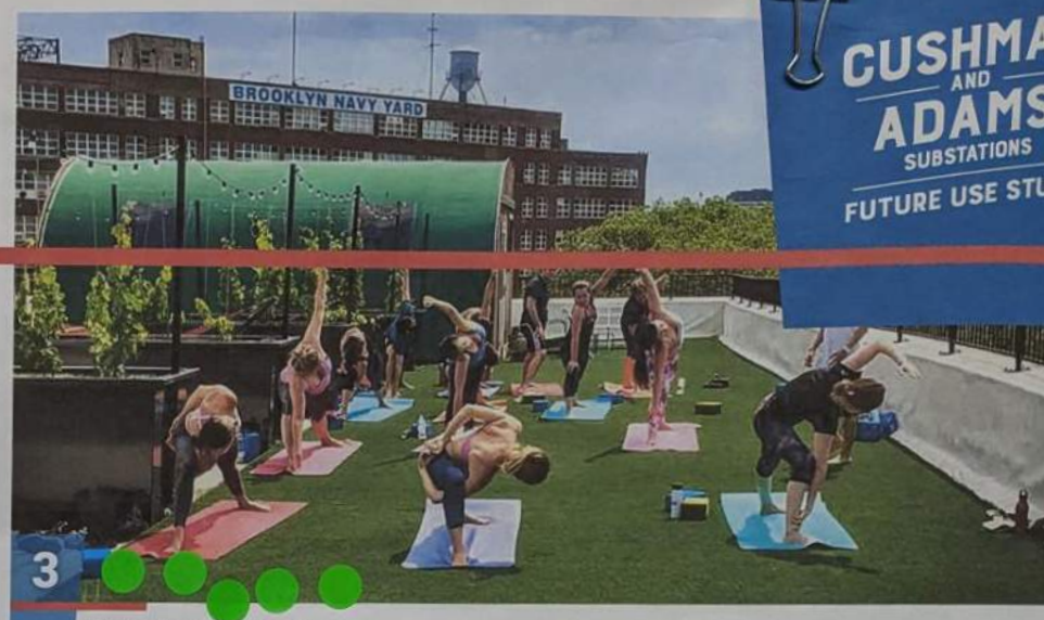
3 Multi-Purpose Rooftop Space and/or Ground Level Green Spaces