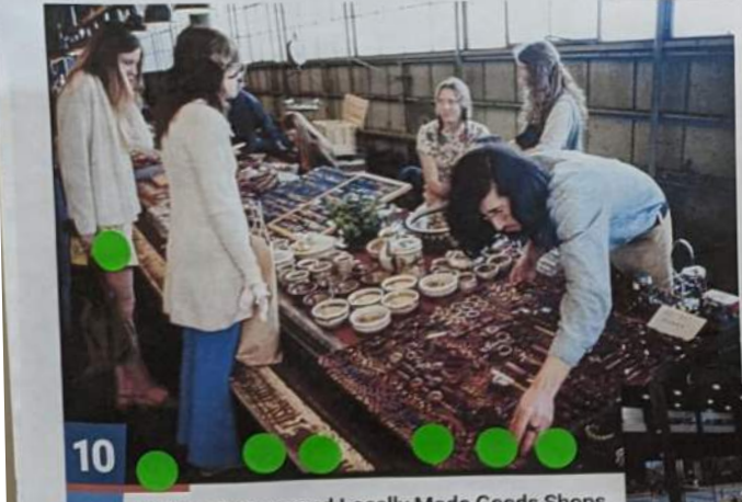
10 Makers Spaces and Locally Made Goods Shops