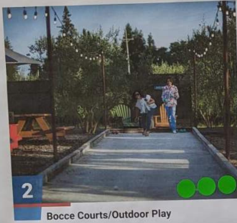
2 Bocce Courts/Outdoor Play