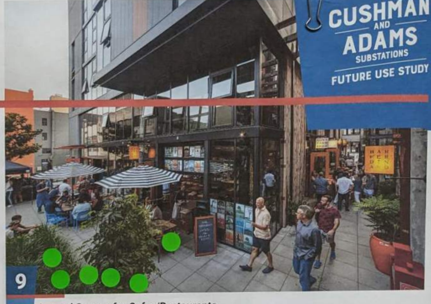
9 Leased Spaces for Cafes/Restaurants