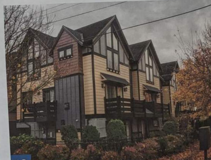
12 Affordable Townhomes/Multi-Plexes