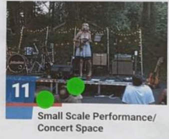
11 Small Scale Performance/Concert Space