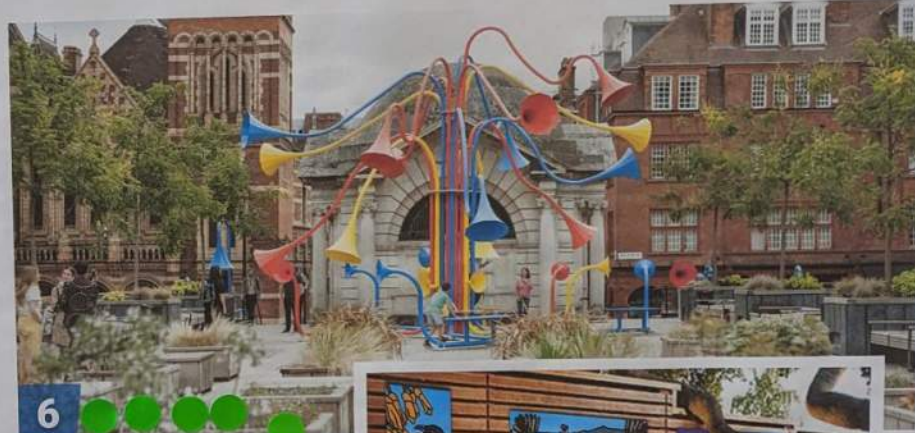
6 Sculpture Gardens/Outdoor Gardens