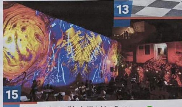
15 Outdoor Theater/Movie Watching Space