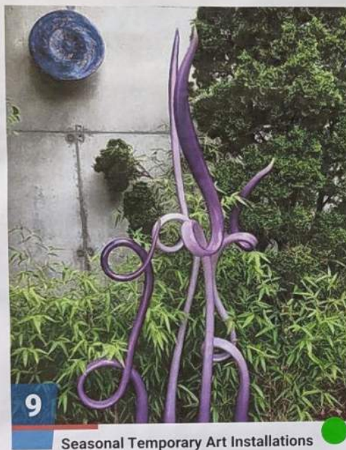
9 Seasonal Temporary Art Installations