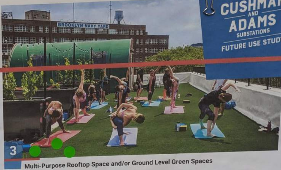
3 Multi-Purpose Rooftop Space and/or Ground Level Green Spaces