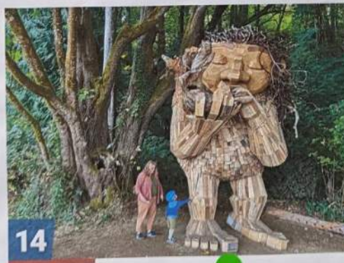
14 Large Scale Art Piece