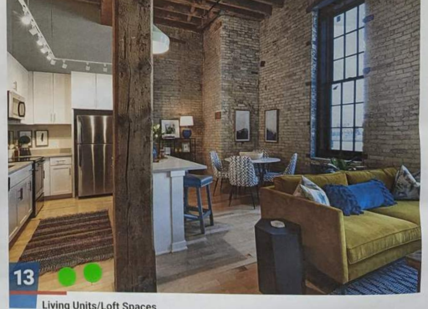
13 Living Units/Loft Spaces