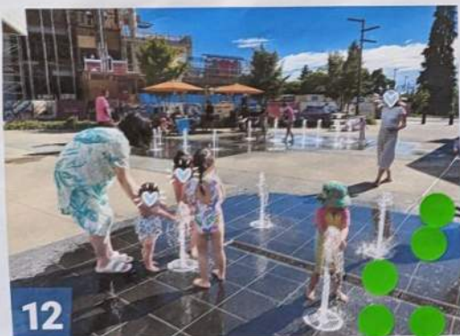
12 Public Gathering Spaces/Play Areas