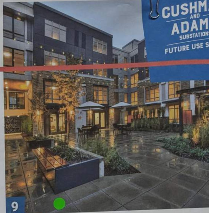
9 Mixed Income Apartments with Amenity Spaces for Tenants