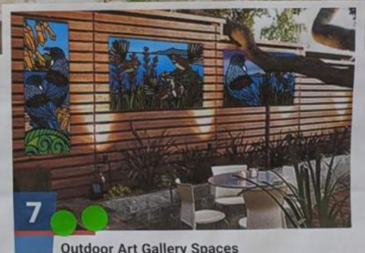
7 Outdoor Art Gallery Spaces