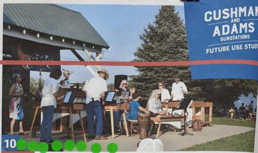
10 Outdoor Lessons/Learning/Performance Spaces