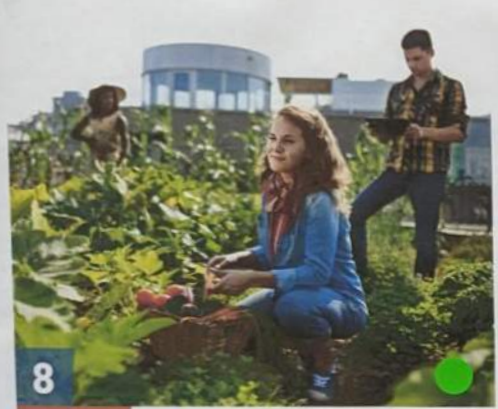
8 Community Gardens

CUSHMAN AND ADAMS SUBSTATIONS FUTURE USE STUDY