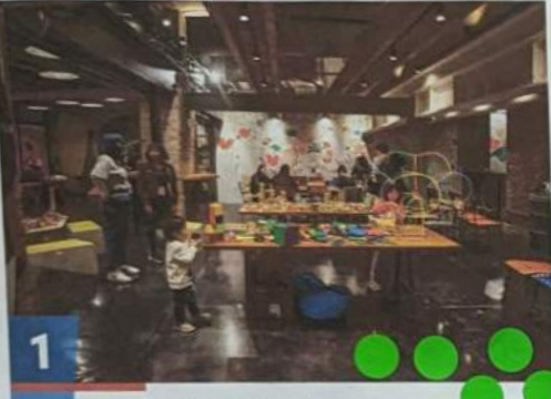
1 Day Care/Learning Centers

CUSHMAN AND ADAMS SUBSTATIONS FUTURE USE STUDY