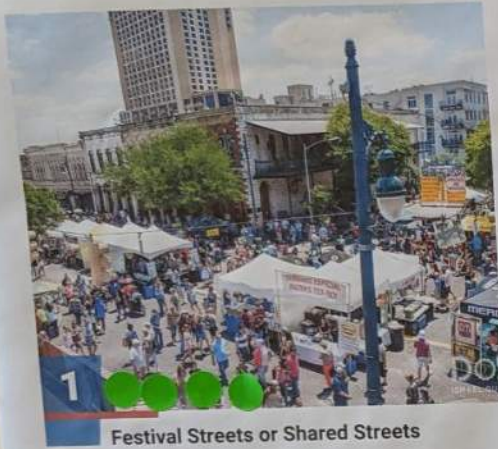
1 Festival Streets or Shared Streets

CUSHMAN AND ADAMS SUBSTATIONS FUTURE USE STUDY