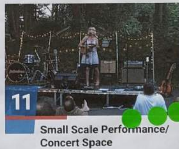
11 Small Scale Performance/Concert Space