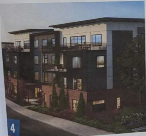
4 Mixed Income Residential