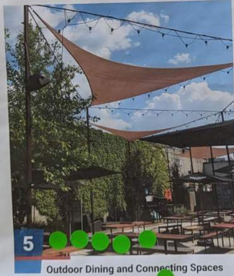
5 Outdoor Dining and Connecting Spaces