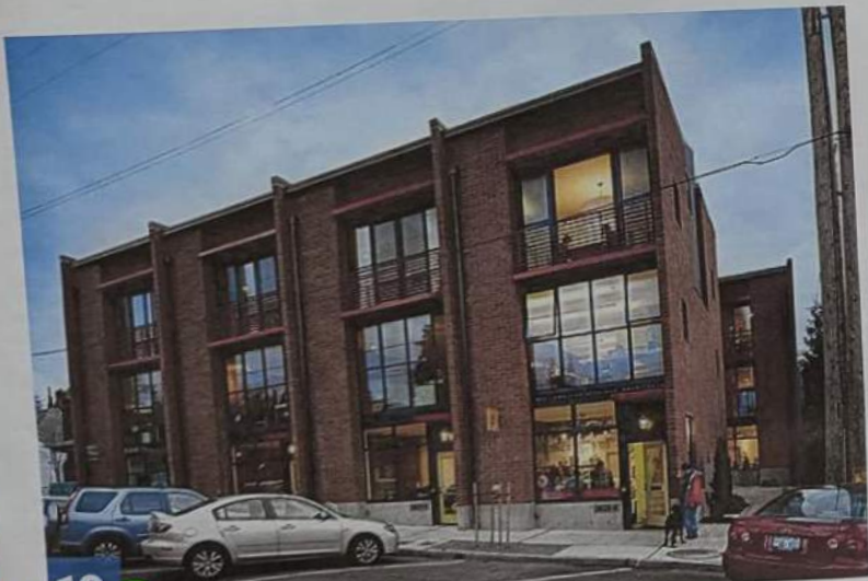
10 Live/Work with Residential over Active Uses (Retail, Studio, Office Spaces)