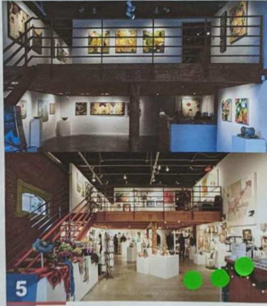
5 Art Gallery/Retail Space