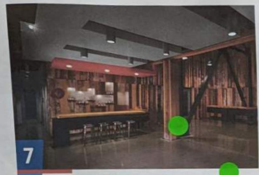
7 Craft Production (e.g. Distillery or Commercial Kitchen)

CUSHMAN AND ADAMS SUBSTATIONS FUTURE USE STUDY